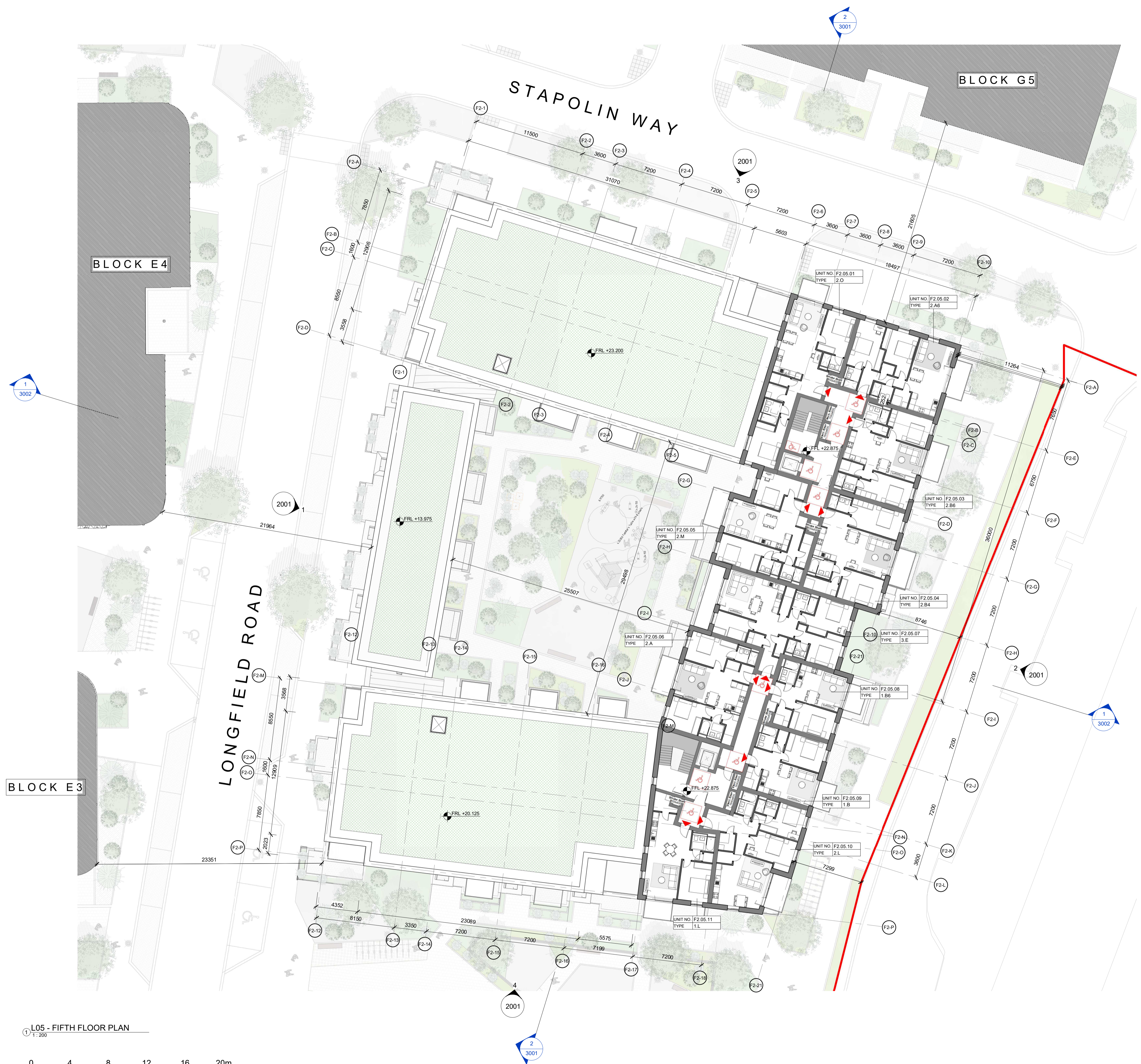
L05 - FIFTH FLOOR PLAN 1: 200